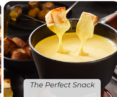
The Perfect Snack